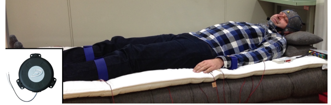
Figure 1: The fbBCI user lying down on a mattress in which the vibrotactile transducers (shown in the left lower panel) were embedded. Six vibrotactile stimulus patterns were given to the user full-body throughout the fbBCI experiment. The picture is included with the photographed user permission.

So far, however, there has been little discussion about classification accuracies of the tactile P300-based BCI. Generally, the tactile BCI paradigms have not been considered as